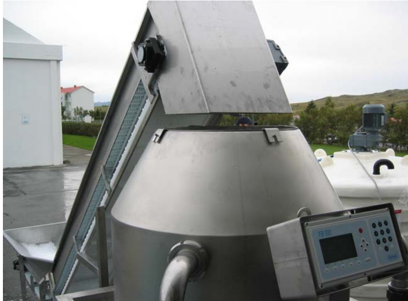
FB-300 Liquid Ice Blender