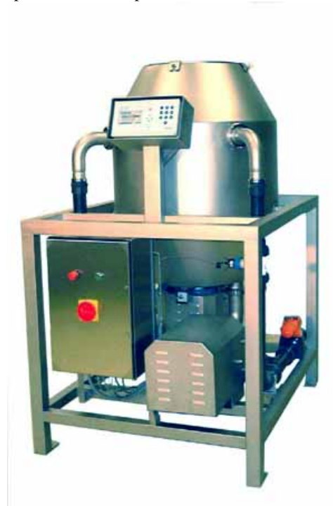
Figure 2: Formax Blender FB-300; Material: Stainless Steel; Height: 1770 mm; Width: 1060 mm; Depth: 1320 mm; Weight: 340 kg

The look of the FB-300 blender is shown in the following sketch. The dimensions are specified in the caption text of the sketch.